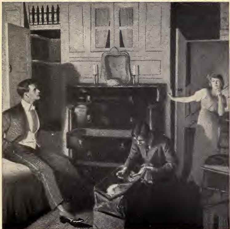
At the sight of Crane, Jane-Ellen stopped with a gesture of the utmost horror